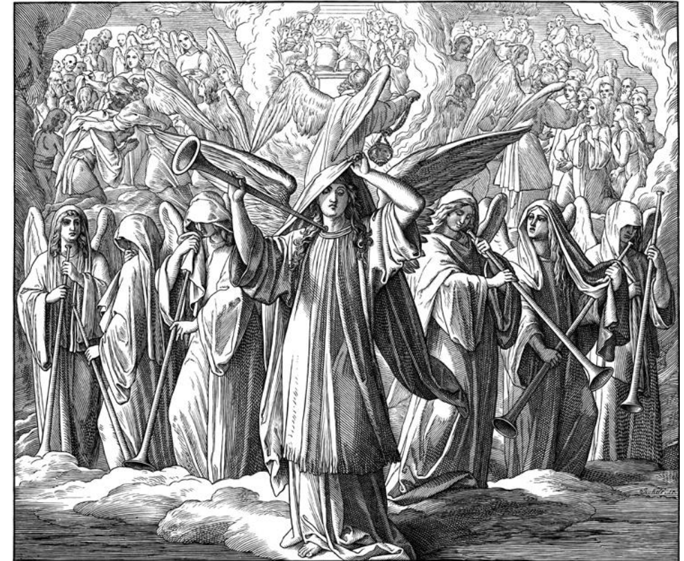
Seventh Seal and 144,000 Sealed

The Spirit and the Bride say, "Come." Let the one who hears say, "Come." Let the one who is thirsty come; let the one who desires take the water of life without price.