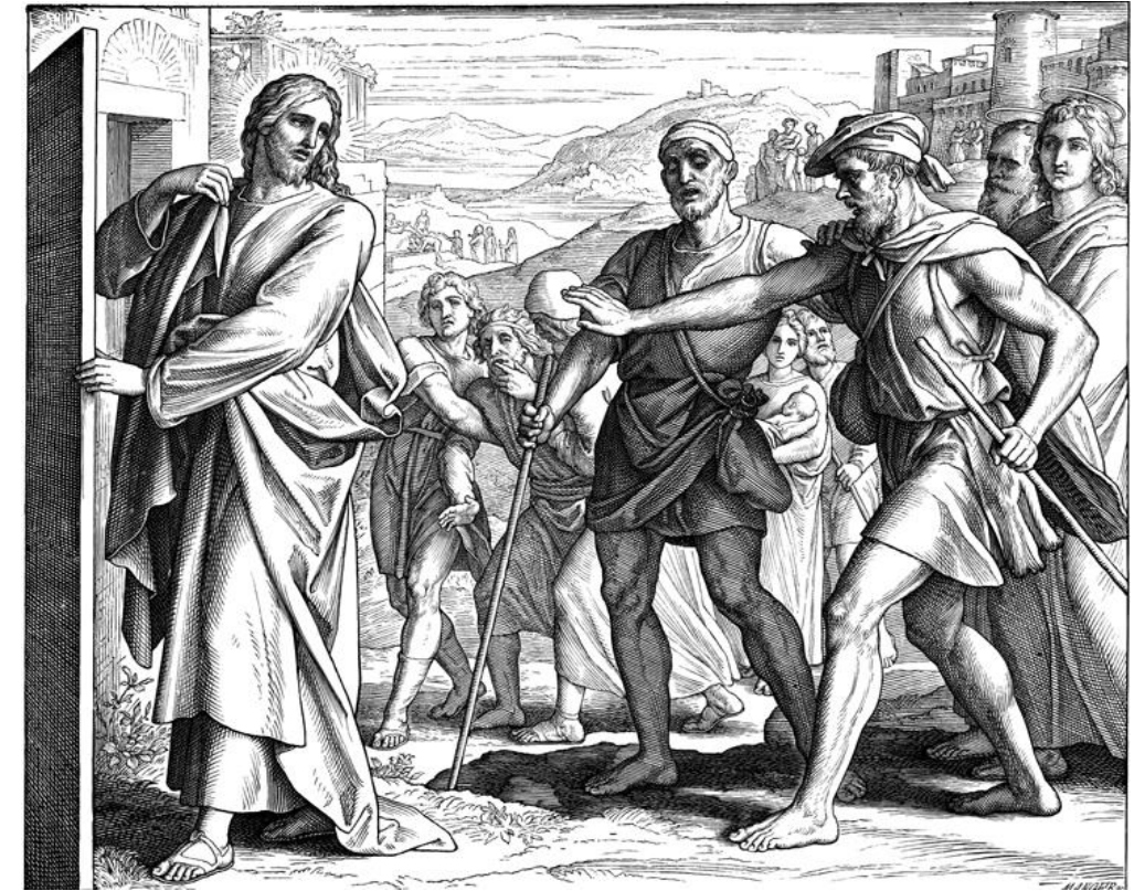
Jesus Heals Many

Jesus went throughout all Galilee, preaching in their synagogues and casting out demons.